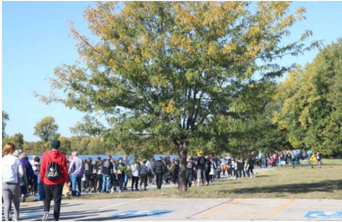
A view of our supporters, starting their walk around the beautiful lake — one community, one mission, and meaningful sponsor visibility.